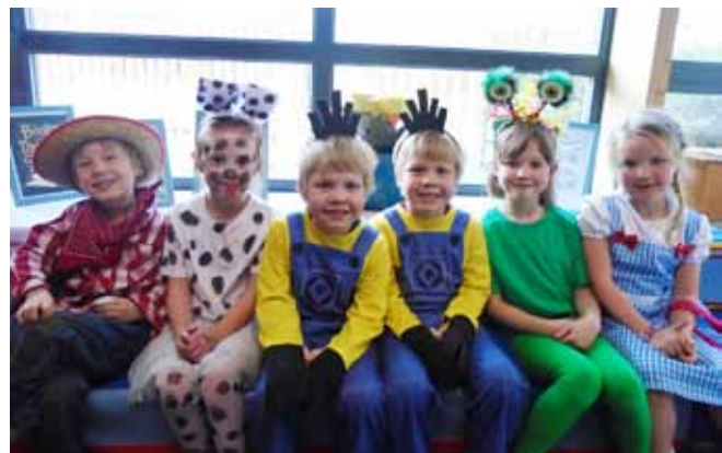
Rowde Academy pupils dress up for book week

At Rowde Academy there was a wacky array of colourful characters pouring through the doors. Included in the mix were three little pigs, Where's Wally, cowboys and soldiers. Children were also asked to bring in their favourite books and we talked about the different characters and the stories. This is a great event to encourage children to enjoy reading books more rather than using iPads.