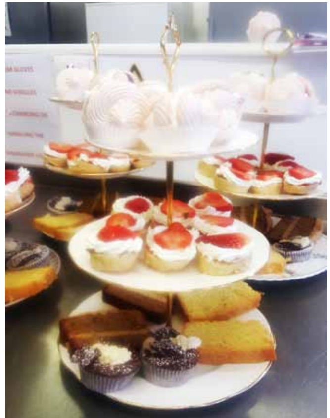
Selection of Cakes from Afternoon Tea

The afternoon tea was hosted by two staff members from all those years ago, with photographs and lots of discussion about how the years have passed and absent friends.