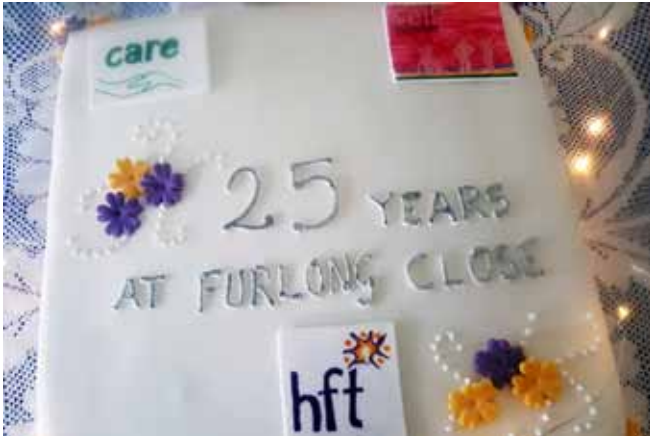
The Celebration Cake

Thursday 21st March, saw the 25th anniversary of the opening of Furlong Close. Some of the people we support here arrived in the very first week and are still happily living here.