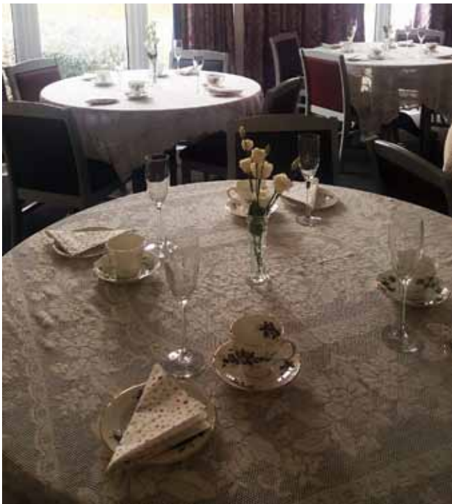
Afternoon Tea at Rowde

As a celebration for those first residents, there was an afternoon tea served in the Wilson Room and a larger celebration in the evening in Marsh Hall, where everyone living here attended for an evening of music, dance and shared supper. Some of the people who use our day services also attended and had a fantastic time.